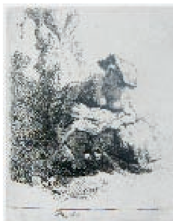
Rembrandt H. van Rijn, A Urinating Woman Beneath a Tree . 1631. Etching, 8.1 x 6.3 cm..

Repression is probably too strong a word. More like keeping things in perspective, keeping things liveable. Seven percent of companies in Flanders have a love policy and in the Netherlands as many as 20 percent of businesses have developed a code of conduct governing love relationships in the workplace. It is a question of not letting lust get too much in the way of profit. Because the couple in love, the solitary paedophile on an online teen chat channel, even the courtly knight from the distant past pining for his faraway lady, all have one thing in common – an all-consuming, completely absorbing devotion. Carried away by the sort of whirlwind in which Dante's lovers find themselves in the second circle of Hell, you can easily do or think strange things. Like sexologist Henry Havelock Ellis, who projected his own urolagnia onto Rembrandt, arguing that the golden tones of the master's paintings were not chosen by accident.