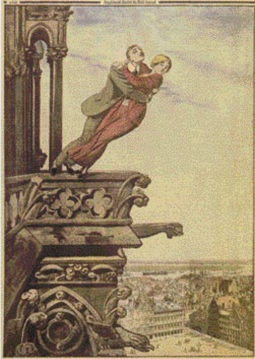
Suicide of two young people, embracing each other while they jump from the Cathedral of Our Lady in Antwerp. From Le petit journal , early 20th century. Volkskundemuseum, Antwerp.