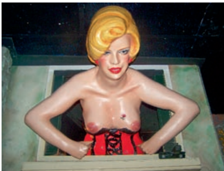
The Amsterdam Sex Museum.