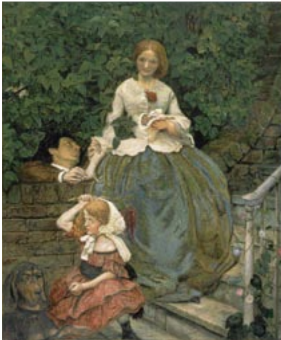
Ford Madox Brown, Stages of Cruelty . 1856-1857. Canvas, 73.3 x 59.9 cm. Manchester Art Gallery.

'Lots of love and sex to everyone – it makes you happy.' That was a New Year's wish in a Flemish weekly at the end of 2007. But does it really? Around the same time Stages of Cruelty , a painting by Ford Madox Brown, was on display in the British Vision exhibition at the Fine Arts Museum in Ghent. A young woman is sitting on a low wall. In her left hand she holds some embroidery work, a young man clings to her right arm. He looks very much in love – there is even a hint of moonstruck rapture in his face – whilst the young woman's posture shows nothing but cool indifference. At her feet a small girl is treating an old dog even worse; she lashes him with a bunch of flowers, flowers with an appropriate name – love-lies-bleeding . No, that does not make you a happy camper.