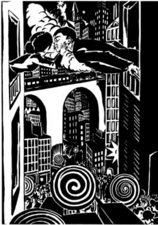
Frans Masereel, The Kiss . 1924. Woodcut, 47 x 33 cm. Museum voor Schone Kunsten, Ghent / © SABAM Belgium 2008.

and toys on and off camera. Santa Claus' sex life, the taste of sperm, where you 'must' have done it and the best ingredients for a loving porn film – they have covered it all, and they start their sixth season in April 2008. But in between times, if you have missed something, or if you would 'rather watch it on your own, without your boyfriend or girlfriend keeping an eye on you' you can see it on the website. You can find handy facts there too, like the information that between the ages of 15 and 60 the average man ejaculates 34 to 57 litres of semen, and that men sometimes call the vagina the 'vertical smile' . We already had 'the face that launch'd a thousand ships' , as Christopher Marlowe wrote about Helen of Troy, but you would do anything for a nice smile too, wouldn't you?